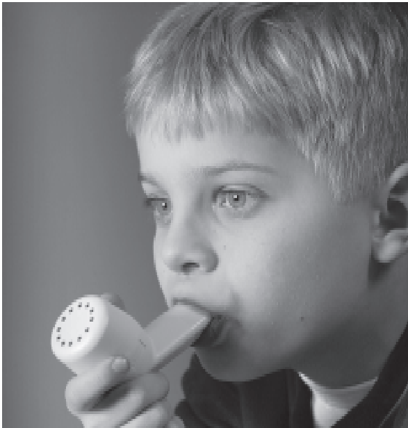
Oscillating positive expiratory pressure (Oscillating PEP) can be done using a Flutter ® device.

Oscillating Positive Expiratory Pressure (Oscillating PEP) is an ACT where the person blows all the way out many times through a device. Types of Oscillating PEP devices include the Flutter ™ , Acapella ™ , Cornet ™ and Intrapulmonary Percussive Ventilation (IPV). Breathing with these devices vibrates the large and small airways. This vibration thins, dislodges and moves mucus. After blowing through the device many times, the person coughs or huffs. This cycle is repeated many times.