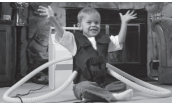
High-frequency chest wall oscillation is the use of a vibrating vest that helps loosen mucus from the lungs.

High-frequency Chest Wall Oscillation also is called the Vest or Oscillator . An inflatable vest is attached to a machine that vibrates it at high frequency. The vest vibrates the chest to loosen and thin mucus. Every five minutes the person stops the machine and coughs or huffs.